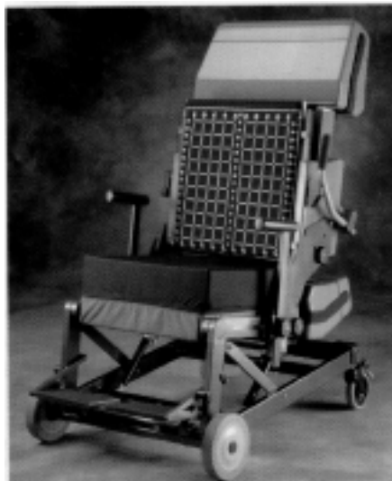
The Shape Sensor simulator by Invacare Corp. is a direct measuring device for cushions and backs.